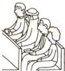
TRYING TO BLEND IN

CHARACTERISTICS OF POTENTIAL NEW VICARS VISITING UNANNOUNCED DURING A VACANCY