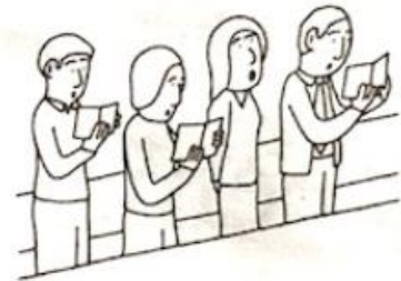
KNOWING A BIT MORE OF THE LITURGY THAN IS NORMAL