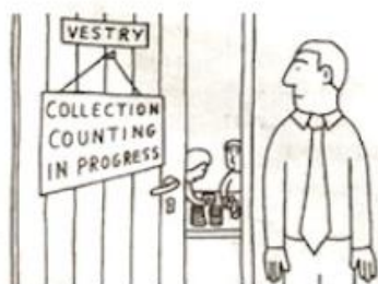
TAKING AN UNUSUAL INTEREST IN THE STATE OF THE FINANCES