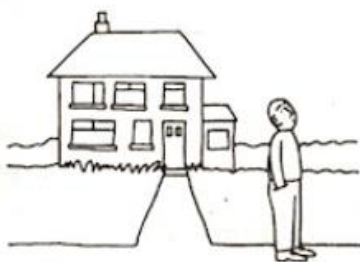
LOITERING NEAR THE VICARAGE