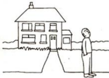
LOITERING NEAR THE VICARAGE