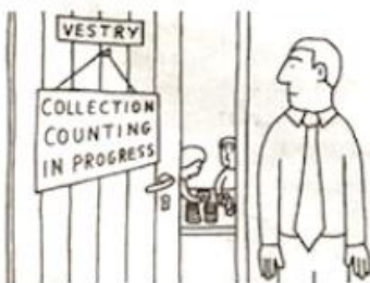
TAKING AN UNUSUAL INTEREST IN THE STATE OF THE FINANCES