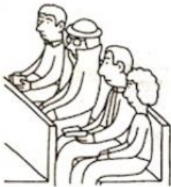
TRYING TO BLEND IN

CHARACTERISTICS OF POTENTIAL NEW VICARS VISITING UNANNOUNCED DURING A VACANCY