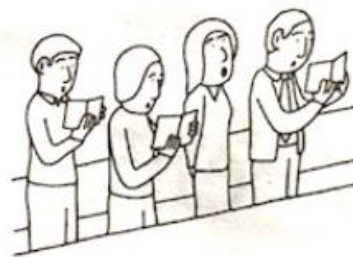
KNOWING A BIT MORE OF THE LITURGY THAN IS NORMAL