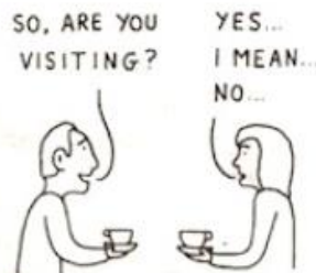
SO, ARE YOU VISITING? YES... I MEAN... NO... APPEARING EVASIVE WHEN ASKED QUESTIONS