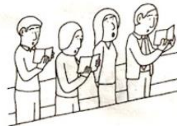
KNOWING A BIT MORE OF THE LITURGY THAN IS NORMAL