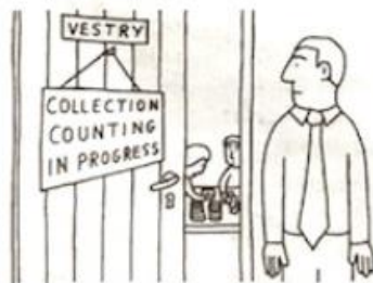
TAKING AN UNUSUAL INTEREST IN THE STATE OF THE FINANCES