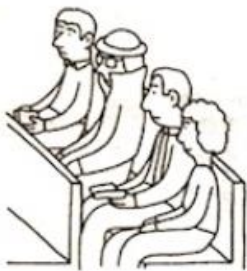
TRYING TO BLEND IN

CHARACTERISTICS OF POTENTIAL NEW VICARS VISITING UNANNOUNCED DURING A VACANCY