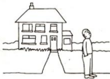
LOITERING NEAR THE VICARAGE